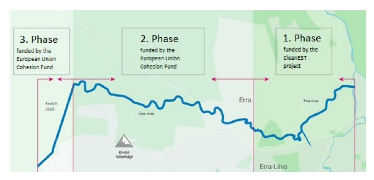
Picture 1. Division of the Erra River residual pollution elimination into phases

The cleaning of the Erra River and the Kiviõli ditch from residual pollution consists of three phases. A total of 4.8 km of the Erra River and a 1.3 km long Kiviõli ditch will be remediated. CleanEST contributes to the first phase of the Erra River works, in which the 2.4 km section of the Erra River will be cleaned from hazardous sediments (Picture 1). The second and third phases will be implemented with funding from the European Union Cohesion Fund (complimentary action). The deadline for works is October 1, 2023.